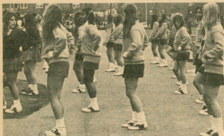
Cheerleaders and Twirlers encouraging the Vikings to their first VICTORY.