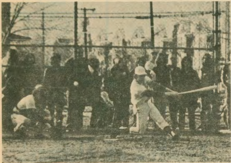
South Shore hits hard but loses to Canarsie 2-1.

One week after the Canarsie trouncing, South Shore once again played well, but lost against Midwood. Considering these three consecutive wins, our team looks extremely promising for the upcoming league-sanctioned season.