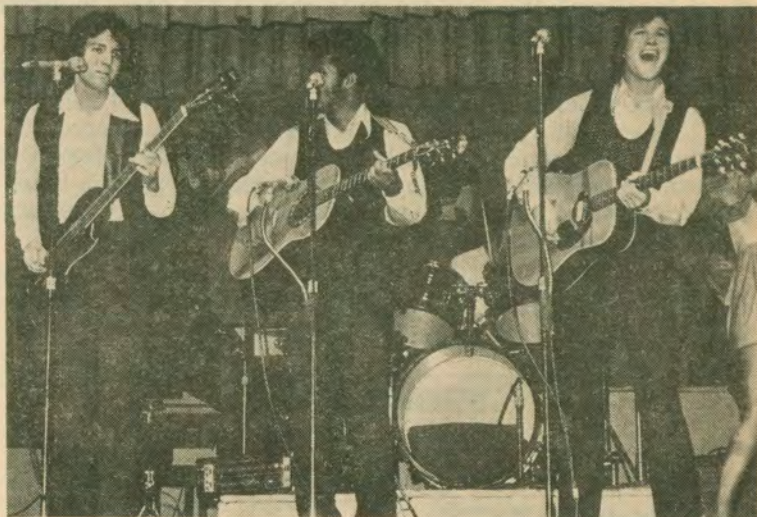
Three stars from "Up With People" bring the South Shore crowd into hysteria.