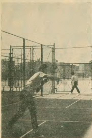
War of the walls.